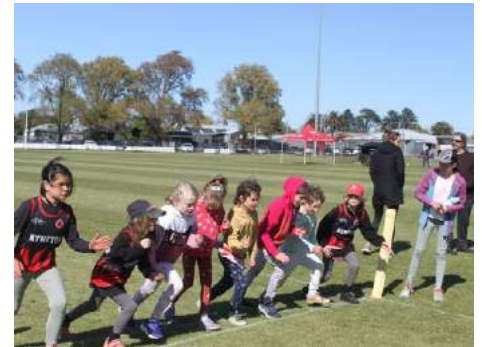
Aspiring little champions at the 400m starting line

You can register your child for Kyneton Little Athletics at www.kynetonlac.com.au .