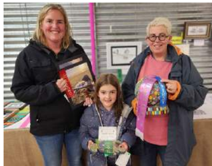
Pavilion winners 2022

Go to www.kynetonshow.org.au for everything you need to know about the Show including purchasing tickets online, entries in the Pavilion and Lego competitions, and the full program.