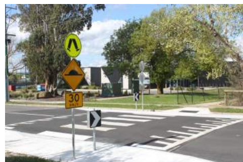
Pedestrian Crossing in Victoria St

It’s not yet open for use but that shouldn’t be far away.