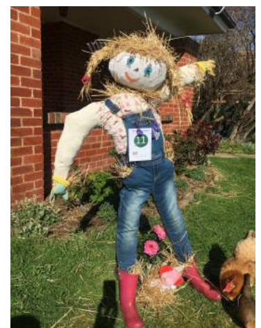
Mirabel and her chicken Isabella

Entries to date can be viewed on three of the Festival’s social media sites – the website, the main facebook pages and on kyneton scarecrows competition facebook . Judging of best entries will take place on Oct 28.