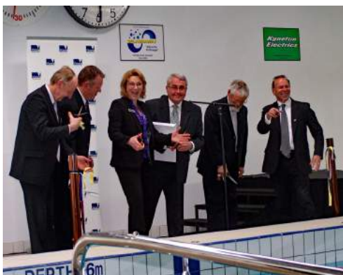
Dignitaries cut the ribbon 10 years ago

The Kyneton Heated Pool Committee and the Swimming Club supported by many others led the quest for the Centre.