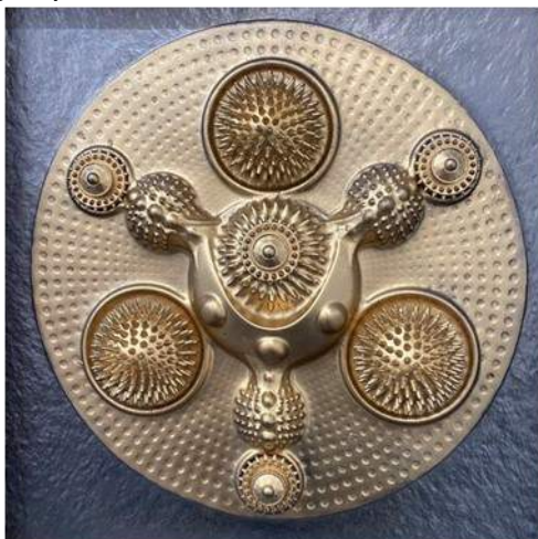
The Grand Order of the Null, 2019 —Jud Wimhurst