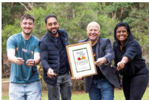
Fook Shing’s Edgy Veggie Award

The café category was won by Macedon Ranges Wholefoods in Gisborne, with Kyneton’s Social Foundry, last year’s café category winner, a close second.