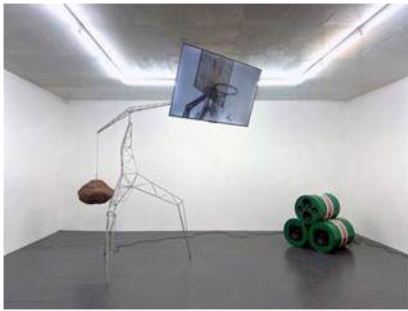
'What goes down must come up' Installation: by Steven Bellosguardo