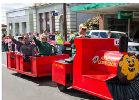
One of Kyneton Lions' trains in the Kyneton Daffodil & Arts Parade