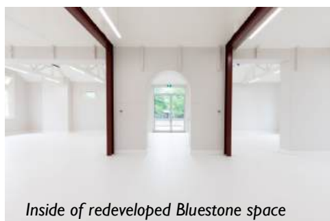
Inside of redeveloped Bluestone space

There is now an opportunity for a head tenant/operator to shape a thriving hub in the heart of Kyneton and write the next chapter for one of the town's iconic historic buildings that is vibrant, accessible and relevant to the local community.