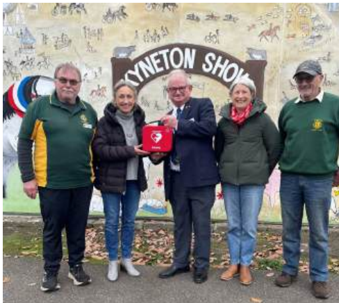
Lions present defibrillator to Show Society

The Kyneton Show returns with the ever-popular Carnival Night and Fireworks on Fri Nov 14 from 5:30pm, followed by Show Day on Sat Nov 15 9am-4pm.