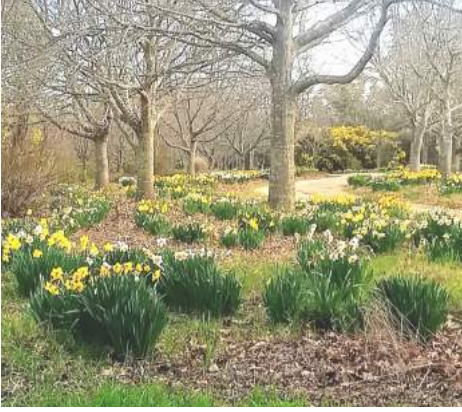
Rosebery Hill Open Garden

As usual some great gardens will be open for visitors during the Kyneton Daffodil & Arts Festival. Some gardens are open on each of the days of the Festival but some are not – Check the Festival website to find details of the gardens and when open. There will be special bus tours of Open Gardens on both Fridays during the Festival.