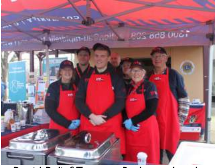
Rapid Relief Team at Barbecue Lunch

Local staff and volunteers supporting those who find themselves at risk of homelessness gathered in Kyneton last week for a barbecue lunch.