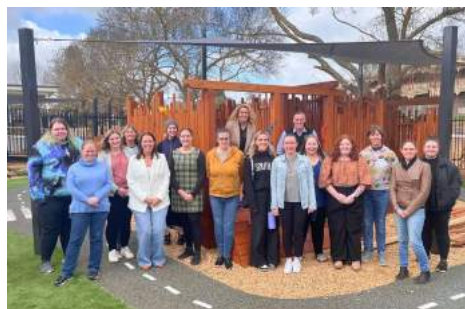
Embracia's staff near the play equipment at the new centre

The Embracia team will be available to discuss its learning programs and introduce themselves.