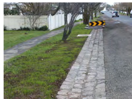
Yaldwyn Street East bluestone gutter

The gutters at the end of Yaldwyn St East have lost most of their semblance of heritage and the new Edgecombe St works, although much better than those in Yaldwyn St East, are rescued by their original backing stone uprights.