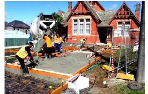
External work at the Red Brick Hall

Regular user groups U3A Kyneton, the Kyneton Art Group, the Handweavers and Spinners and the Kyneton Municipal Band will then be able to move back into their home.