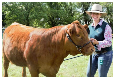
See prize livestock at the Kyneton Show on Sat Nov 19

Get in early and buy your tickets online: www.kynetonshow.org.au .