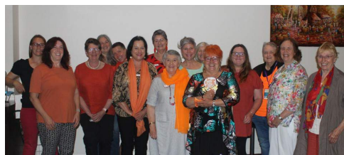
Zonta members wore orange to mark 16 Days of Activism in 2021

Come along and learn more about 16 Days of Activism to prevent violence against women, while sharing a cuppa and cake with Zonta's passionate Club members.