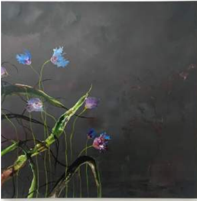
Aconitine (toxic serie), 2023