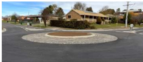
The new roundabout along Campaspe Drive.

KOR are now in the process of commencing preliminary works for the planned traffic signalization works along Mollison St.