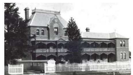
1908 image of the original 3 story building.