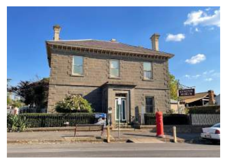
Dementia retreat program

The exhibition will be on show until late October.