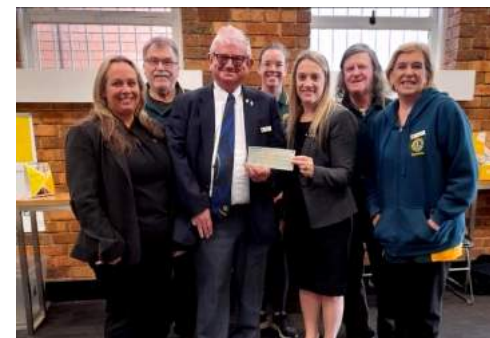
Lions Club members receive cheque from CBA staff