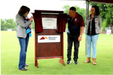
Unveiling the Plaque

Barkly Square will soon return to full use following a comprehensive upgrade of its playing surface.