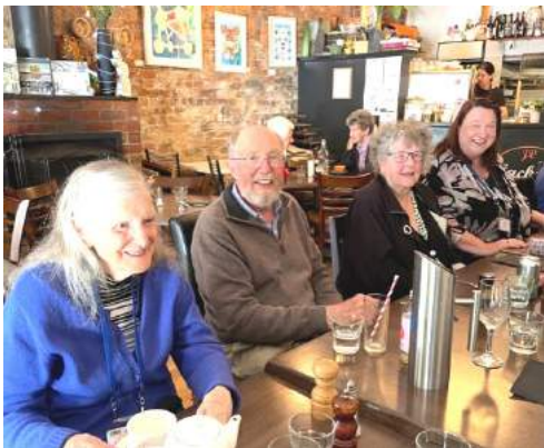
U3A members enjoying Lunch Club

U3A Kyneton provides a stimulating environment for Macedon Ranges residents who have retired from full time work, enjoy meeting people and want to keep active.