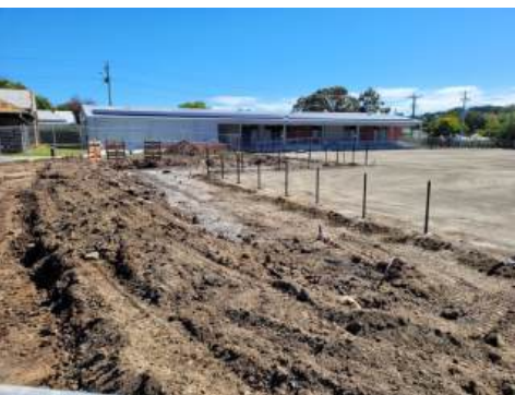
Netball courts on Apr 3—a work in progress

On Apr 3 the netball matches were relocated to Woodend and shuttle buses were provided between Kyneton and Woodend.