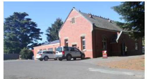
Kyneton Uniting Church Op Shop

Donations can be left at the rear of the shop.