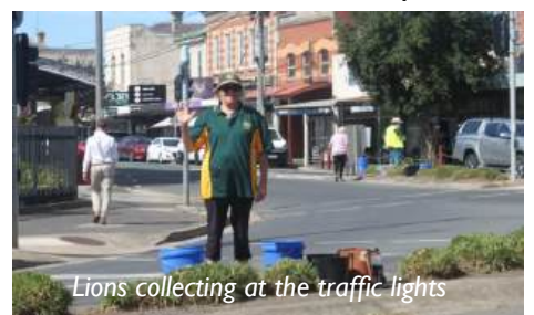
Lions collecting at the traffic lights

A further $8781 was raised from other sources including $7110 from collections at Woolworths Kyneton.