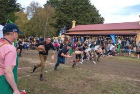
The Spud Olympics

Fresh from being crowned Gold in Australia's Top Tiny Tourism Town Awards, Trentham will welcome more than 10,000 visitors on 2–3 May for the 19th Great Trentham Spudfest.