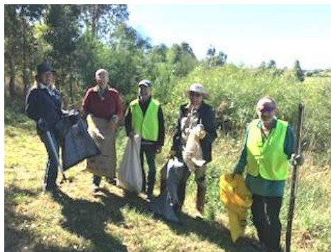
CR&LMG volunteers on Clean-up Australia Day in March

Tools are provided. Wear gloves and sturdy shoes and BYO water and spend a couple of hours improving our local riverside.