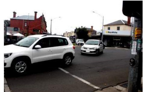
The Study has ideas for many intersections

The draft contains recommendations for all aspects of infrastructure and movement including vehicular traffic, pedestrians, cyclists, public transport and parking.