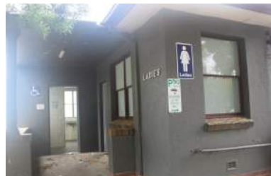
Hutton St—no sanitary bin