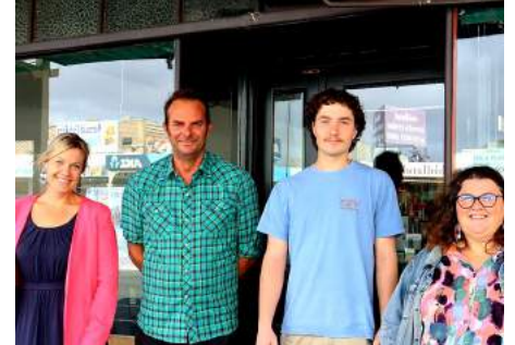
The Community Lunch team

KCH is also offering free events for Carers.